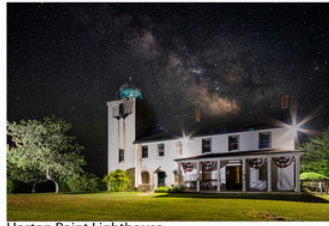
Horton Point Lighthouse